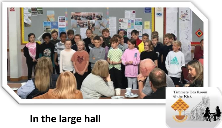
In the large hall